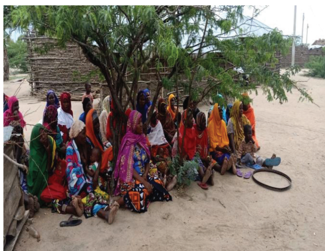
Photos taken during the CUC-Community Dialogue Meetings in Tana River