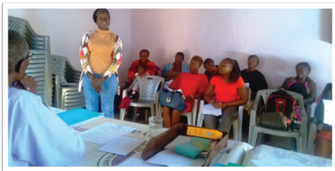
Self-Representation Client demonstrating how to present her case in court during training at FIDA-Kenya Kisumu

"I did not know that I could speak in court, let alone have the courage to directly address my partner until I attended self-representation training at FIDA-Kenya. This boosted my confidence levels and restored my self-esteem." Self-representation client, Mombasa, 26 th November 2019