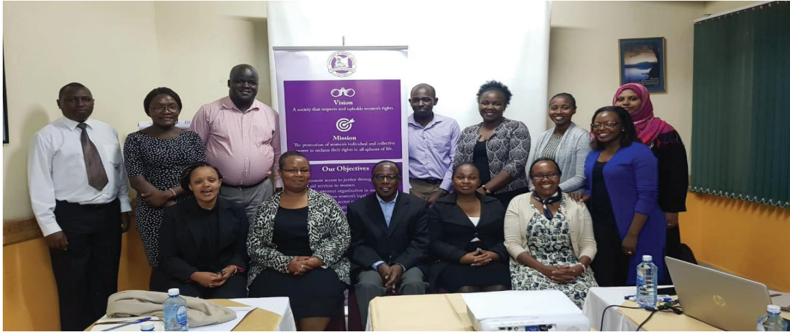
FIDA-Kenya Management team attending Performance Management Training at Gracehouse Resort in Nairobi on 21 st & 22 nd May 2019.