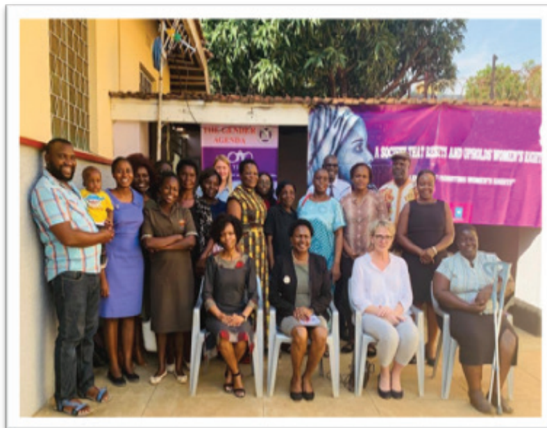
Visit by Danish Ambassador on 17th September 2019 to the FIDA-Kenya Kisumu Office.

FIDA-Kenya would like to convey its gratitude and appreciation to our development and strategic partners who provided financial, mentorship and advisory support in 2019. We remain indebted to them and look forward to a continued collaboration as we promote the rights of women and girls in Kenya and beyond.