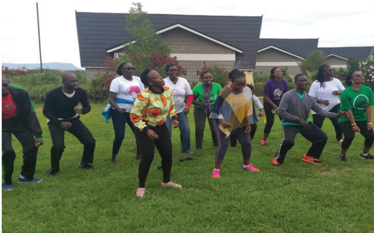
Staff team building activity at Stoni Athi Resort on 28 th June 2019

In the words of Henri Ford, "Coming together is a beginning, staying together is progress, and working together is success." FIDA-Kenya has continued to invest in employee wellness, team building and staff debriefing to enhance coping mechanisms for secondary trauma, and bonding among staff members, and help the team remain emotionally engaged to deliver the FIDA-Kenya strategic intents.