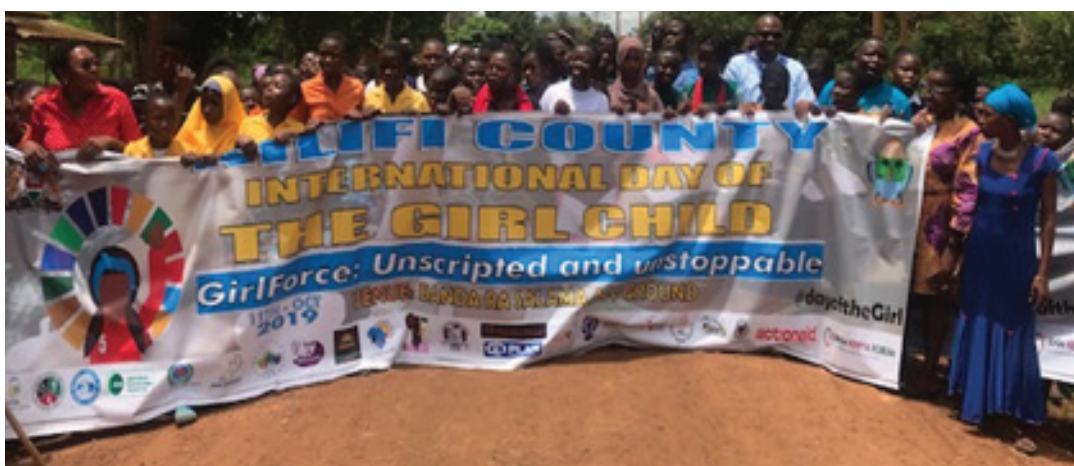
International Day of the Girl Child held on 12 th October, 2019 at Banda La Salama, Kilifi County organized by Kilifi County to address the need for more opportunity for girls and increase in awareness of gender inequality faced by girls worldwide based upon their gender.