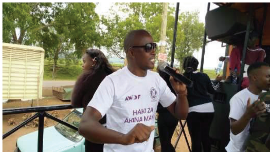
From left to right: FIDA-Kenya's legal aid team preparing for a road show and legal aid clinic in Naivasha on 31 st August 2019 and the road show Master of Ceremony (M.C) calling on members of the public to attend the road show stops at the market places and legal aid clinic at Moi Gardens Kericho on 22nd and 23rd June, 2019