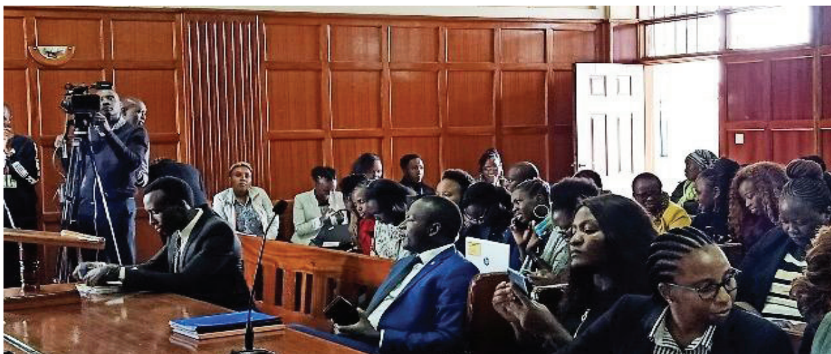
Advocates and members of the public at the Milimani Constitutional Court on 12 th June, 2019 eagerly awaiting Judgment

Judgment in this matter was delivered on 12 th June, 2019. The constitutional court held, briefly, that: