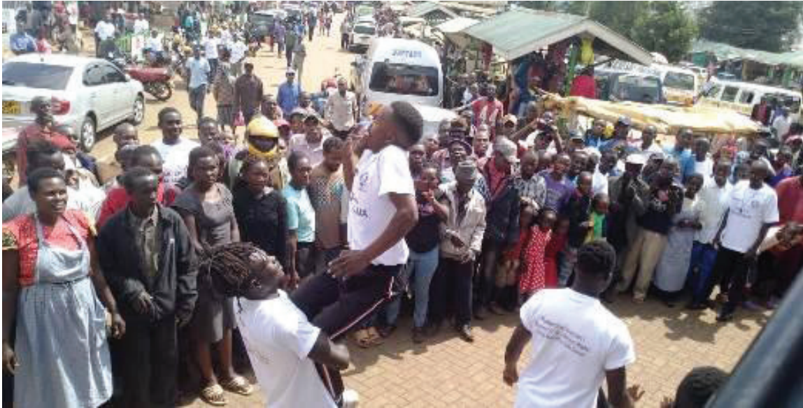
Entertainers performing an educative skit to members of the public at Jerusalem market at a stop during the two-day road show held in Kericho on 22nd and 23rd June, 2019