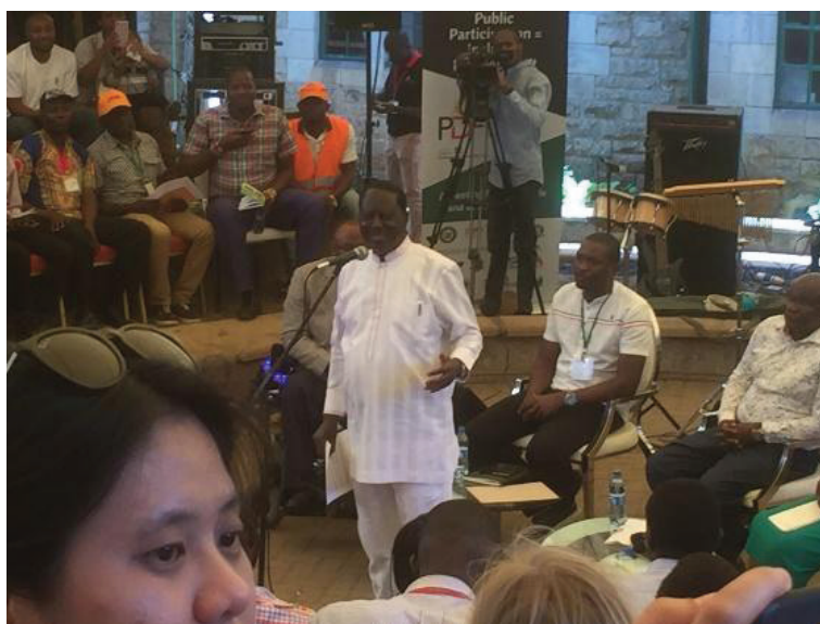
Former Prime Minister addressing the People's Dialogue Forum on the Two Thirds Gender Rule