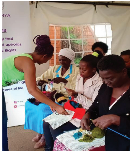
From left to right: Beneficiaries of an economic empowerment session at FIDA-Kenya Nairobi offices gain new skills on embroidery. A jewellery shop started by a beneficiary of capacity building on financial management in Kericho.

The organization intensified activities in the horticultural sector aimed at safeguarding women's labour rights. With projects being implemented in the tea zones of Kericho and the floricultural industry of Thika and Naivasha, focus has been on sensitizing women workers, key stakeholders and the communities around them on their labour rights. Women in the horticultural sector are still vulnerable, with exposure to chemicals which affect their reproductive health and general wellbeing, low wages, long working hours especially during peak seasons, sexual harassment at the work place and forced early retirement. More effort is required from all stakeholders in this sector to ensure it operates as per international standards or the United Nations guiding principles on business and human rights.