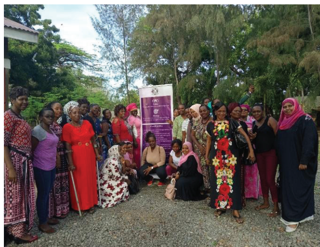
GRB training of Grassroots Women at Red Cross Hall, Kilifi.