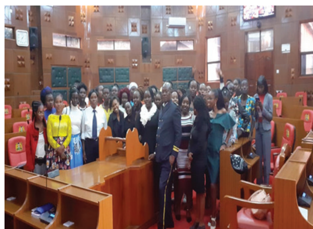
Female student leaders at the Nakuru County Assembly on the 20 th November 2019