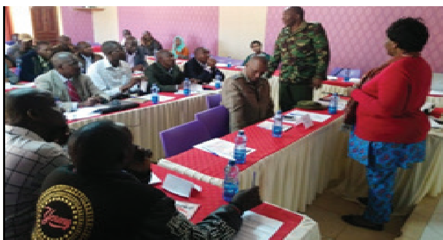
A police officer joins colleagues during the duty bearers training

FIDA-Kenya continues to support duty bearers and stakeholders to eradicate harmful practices against women in Kenya. Police officers were trained on the Anti-FGM Act and on various strategies for prevention of SGBV. The training was given impetus by the President's declaration to eradicate FGM in Kenya by 2022 and by the 12 Commitments of ICPD25 that was held in Nairobi. FIDA-Kenya sought to capacity build duty bears and paralegals with knowledge on case management (gender based violence, female genital mutilation and child marriage prevention, response, referrals and prosecution) to improve gender based violence responsiveness, increase access to accurate and appropriate information services on female genital mutilation, child marriage and management of cases. As a result, increased efforts in eradication of FGM and enhanced stakeholder engagement in the FGM focus counties. It is hoped that with the Nairobi Commitments, many more stakeholders shall join the fight against FGM in Kenya.