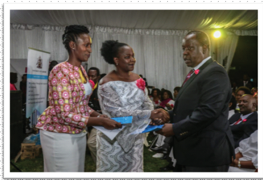
Presenting a petition to Interior CS Dr. Fred Matiangi

FIDA-Kenya conducted advocacy and policy influencing at various levels to safeguard and enhance women's rights across the Country. With the rising cases of violence against women and femicide in the Country, FIDA-Kenya and other partners held an EndFemicide Advocacy vigil at the University of Nairobi Grounds. FIDA-Kenya and partners came together to organize a Vigil in honour of victims of femicide and gender based violence. The event was held at the University of Nairobi, and university students and members of the public were mobilized to attend. The Chief Guest, Dr. Fred Matiang'i, CS Interior undertook to work with the Police and the Director of Public Prosecutions to ensure that those cases were reduced and perpetrators arrested. The CS committed to set up a Directorate within the Police Service to specifically deal with cases of GBV in Kenya. FIDA-Kenya is following up on this commitment.