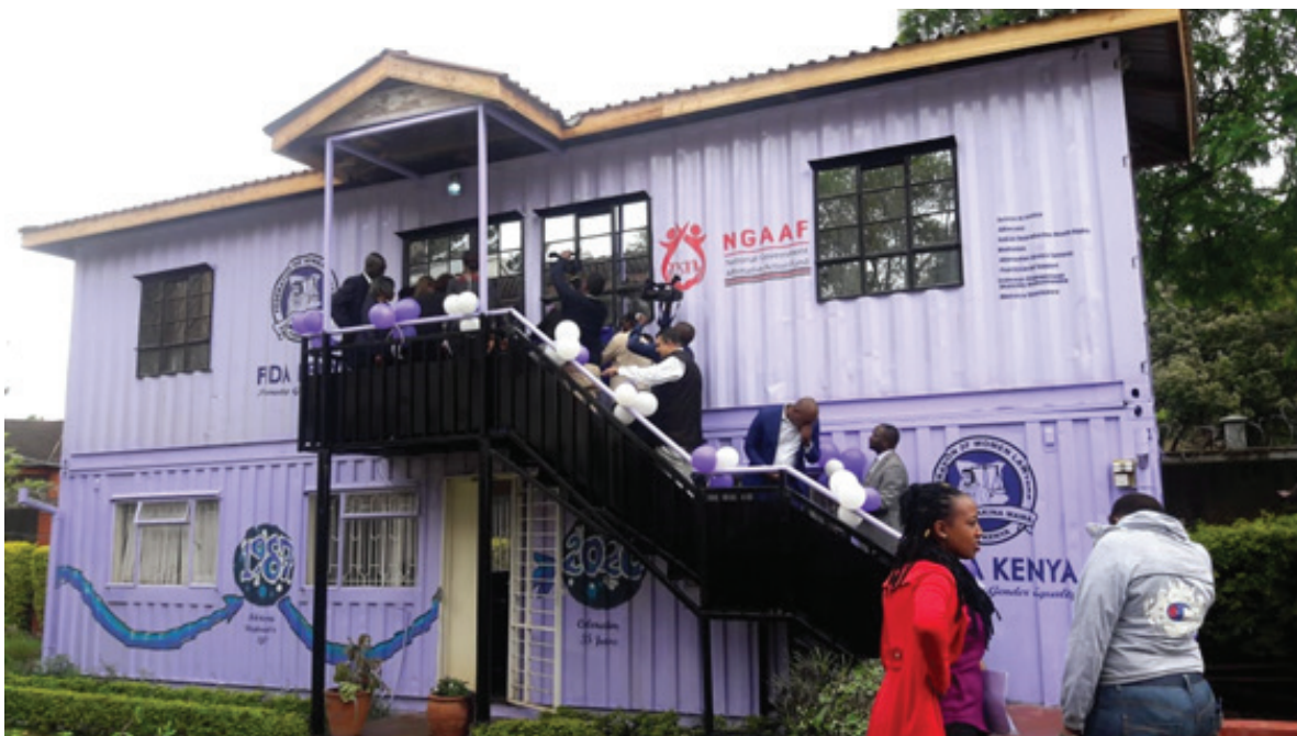
Family Mediation Centre at FIDA-Kenya supported by NGAAF

Working in collaboration with Mediation Training Institute International, an accredited training institute recognized by the Kenyan Judiciary to train professional mediators, FIDA-Kenya has become a one-stop shop for affordable, quality training, mentorship and practice. This has greatly increased the pool of mediators available for both FIDA-Kenya mediations and the Court Annexed Mediations to handle the growing demand for family mediation.