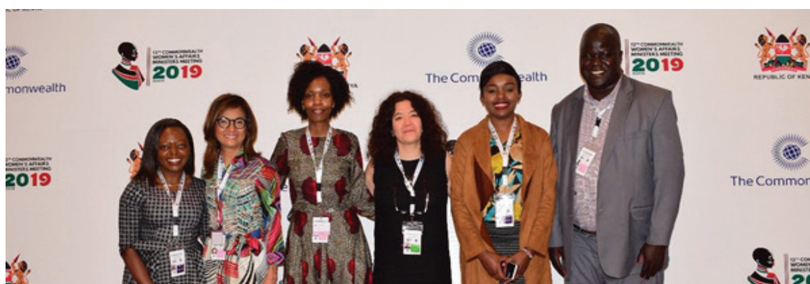
FIDA-Kenya staff pose for a photo with delegates during the 12th Commonwealth women's ministerial meeting in Nairobi