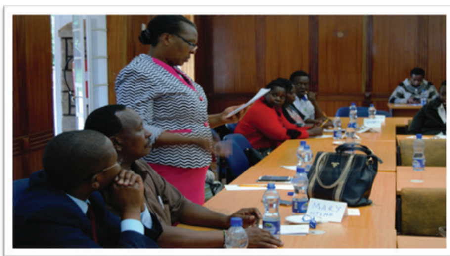
An official from Nyeri County taking part in the training.

FIDA-Kenya conducted capacity building sessions for County Officials from seven counties on Gender, Gender Mainstreaming and Gender Responsive Budgeting. The county officials trained were from Kisii, Siaya, Tana River, Mombasa, Uasin Gishu, Nyeri and Kilifi Counties. The participants in attendance represented various departments in the county including Chief Officers and Directors. From the discussions, it emerged that the public has little or no basic understanding of gender responsive budgeting. It also emerged that the members of the public in the various counties do not show up for the various public participation forums to interrogate the budgets, and usually affirm what the politicians say without taking time to verify how true these are. There is also minimal participation of women when it comes to budgeting process, and the county officials requested for more support from FIDA-Kenya through empowering the public during the public accountability forums so as to have a more informed citizenry and enhance participation an inclusion of women, youth and persons with disabilities not just in the budgeting process, but also in the public participation processes.