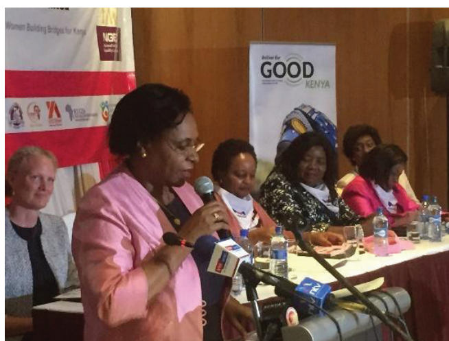
Gender Cabinet Secretary giving her remarks during the Embrace Women's Convention in February 2019.

"We are gathered here to demand for increased women's participation. We are grateful to FIDA-Kenya for bringing us together, and as the nation discusses the proposed referendum, women are going for not less than 50:50 representation. Nothing less!" Kitui Governor H.E Charity Ngilu at a Convention on 4 th February 2019.