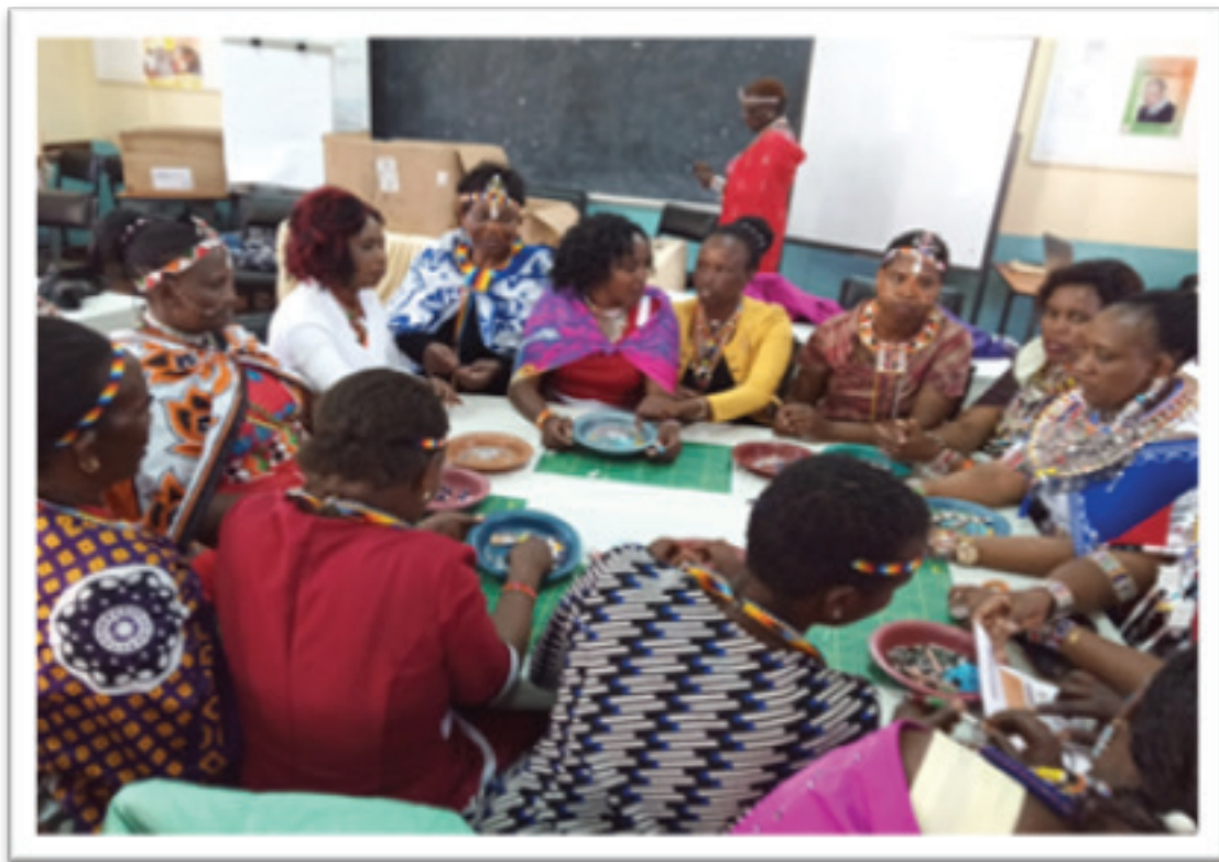
Women engaging in Johari Beads Production

FIDA-Kenya also partnered with Ushanga Kenya with funding from UNFPA to produce (Johari) beads with information on ending FGM. This initiative was Anti-Female Genital Mutilation Board's, following the president's declaration to end FGM by 2022. Women from three FGM hotspot Counties of Narok, Kajiado and Samburu were mobilized to work on the prototype Johari beads production. The beads were launched by the President during a high level meeting of elders on 8th November 2019. The initiative will continue to be implemented in 2020 at the county level.