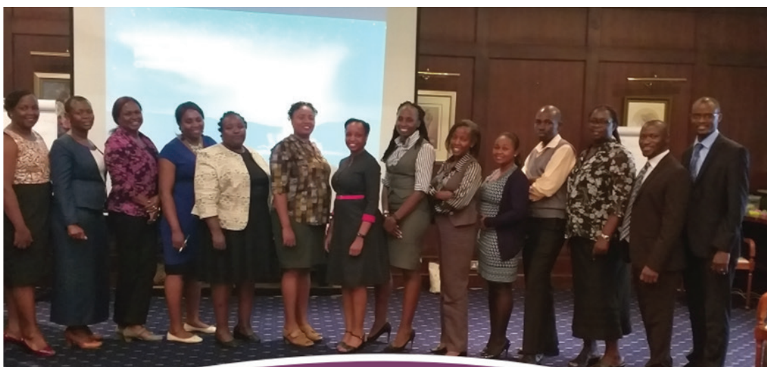
Board Effectiveness Training at The Lord Errol Gourmet on 17th January 2019.

In 2019, FIDA-Kenya continued to invest in training and capacity development with the focus being on group trainings. 90% of the organization's training needs for the year were implemented. Some of these included effective performance management and leadership for managers and senior program officers; resource mobilization, monitoring & evaluation, and program outcome harvesting. Further, the managerial team and Board participated in leadership discovery insights and effectiveness training.