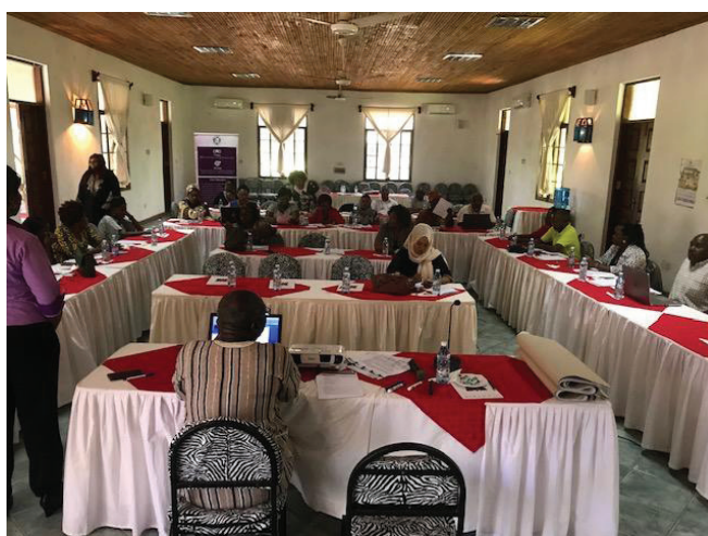
Round Table Meeting of MCAs, Directors, CECs and Grassroots Women on County Resources Allocation Held on 9th October, 2019 At Baobab Sea Lodge