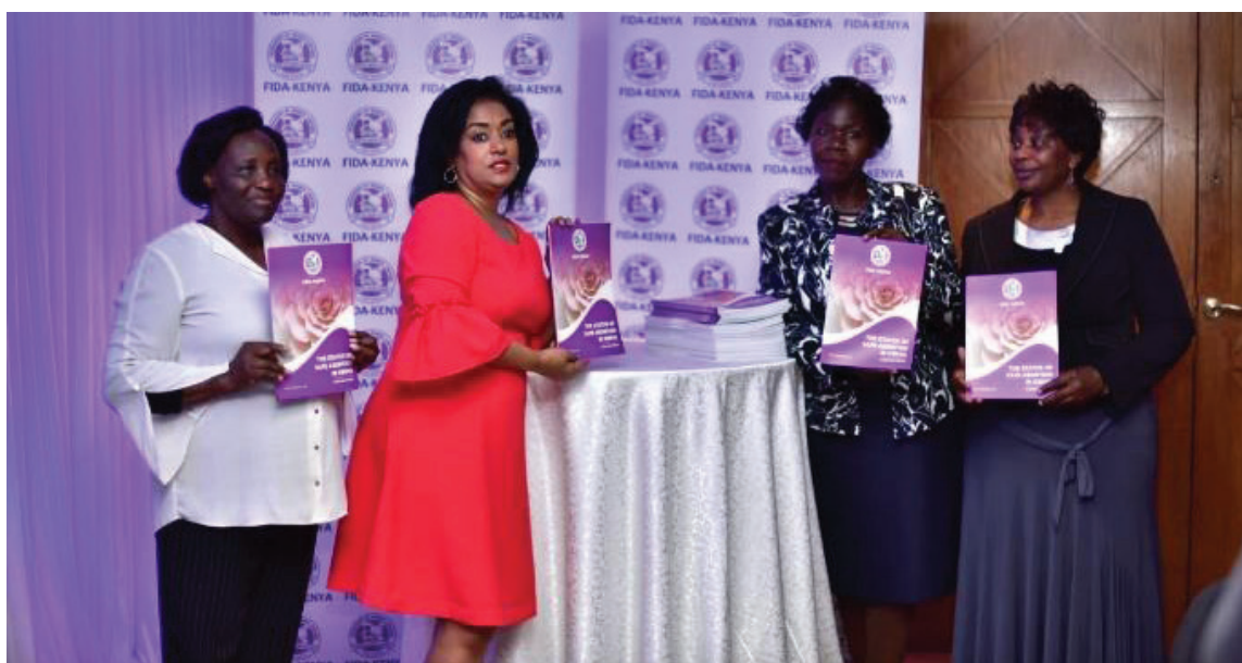
The Chief Guest, Hon. Esther Passaris Launching the Baseline Report

FIDA-Kenya continues to conduct advocacy for women's reproductive rights. Having conducted a baseline survey in 2018, FIDA-Kenya published a report detailing the Status of Safeguarding Constitutional Rights to Safe and Legal Abortion for Girls and Women in Kenya . The report highlighted the findings of the Survey. With thousands of women still procuring unsafe abortions every day in Kenya, FIDA-Kenya engaged in advocacy efforts to ensure that women would be free to enjoy their Sexual and Reproductive Health Rights across the country. The Organization is using the Baseline Survey report for this advocacy.