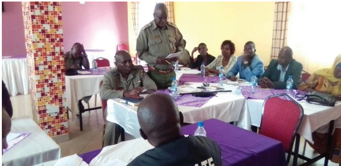
Photo taken during the CUC meeting in Kisii on 29th August 2019

offences. The team was also able to explain the concept of alternative justice system, its limitations as well as the court annexed mediation. Through this forum the different actors also got feedback on how to improve their services and insights on emerging issues in the area. The Organization learnt that the Nyumba Kumi initiative had brought about discord in the community because of competition among the Nyumba Kumi groups. It was recommended that the groups be included in CUCs to enhance cooperation and their support for access to justice in the region.