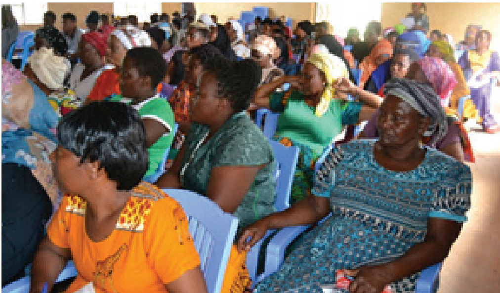
A section of community members keenly following a training session.

In Taita Taveta for instance, the paralegals facilitated community discussions on their community land resulting into the development of a Mining Charter. In Vihiga, the paralegals have been able to mobilize themselves to support women who have undergone violations in relation to land and property. FIDA-Kenya has also established that the paralegals have had a renewed energy to advocate for women's rights and to seek legal aid redress for women in their communities. In Taita Taveta, the paralegals were able to intervene in a case where a widow was evicted from her matrimonial home by her in-laws. The paralegals with the assistance of the police had the perpetrators arraigned in court and the matter settled through mediation. The widow is now back in her matrimonial home and is living peacefully with her in-laws who now understand that widows have a right to inherit from their late husband's estate.