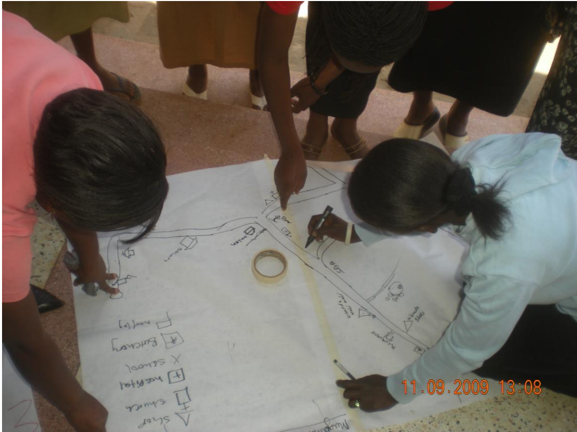
Figure 3: Research participants from Kangemi during a community mapping session