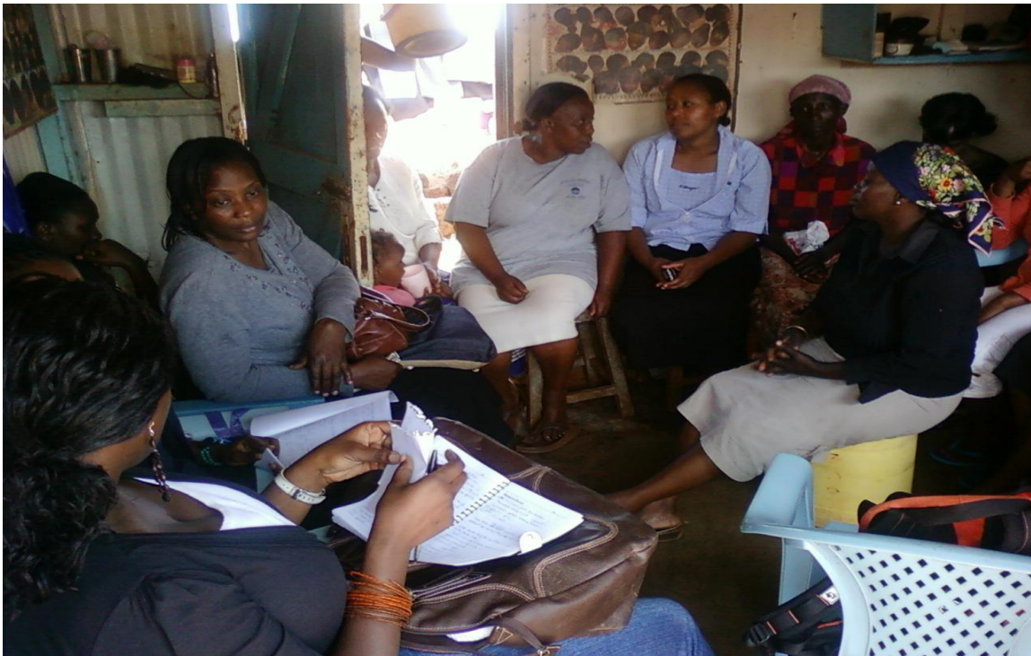
Figure 4: Researchers and participants during a focus group discussion in Kangemi