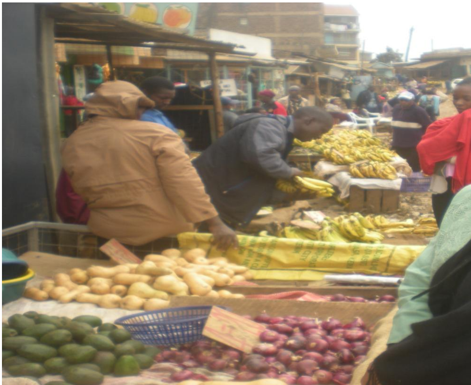
Figure 6: Kawangware Market

In the end, the research process was successful. It was encouraging to see the women come up with the solutions to the issues that they faced and support each other not only financially-through the kitties - but also in learning about their rights as business people and just as women. It was also encouraging to see that they all were keen on spreading their knowledge and experiences with other women in their individual and one can only hope that what they have started will be sustained and continue to empower them.