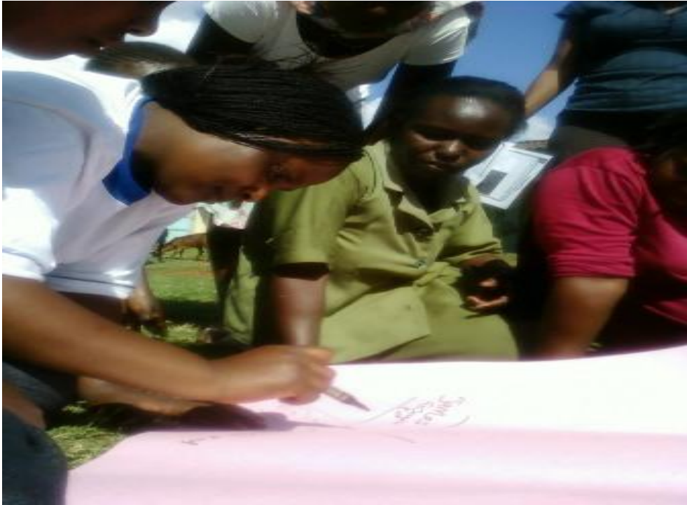
Figure 1: Research participants take part in community mapping in Kawangware