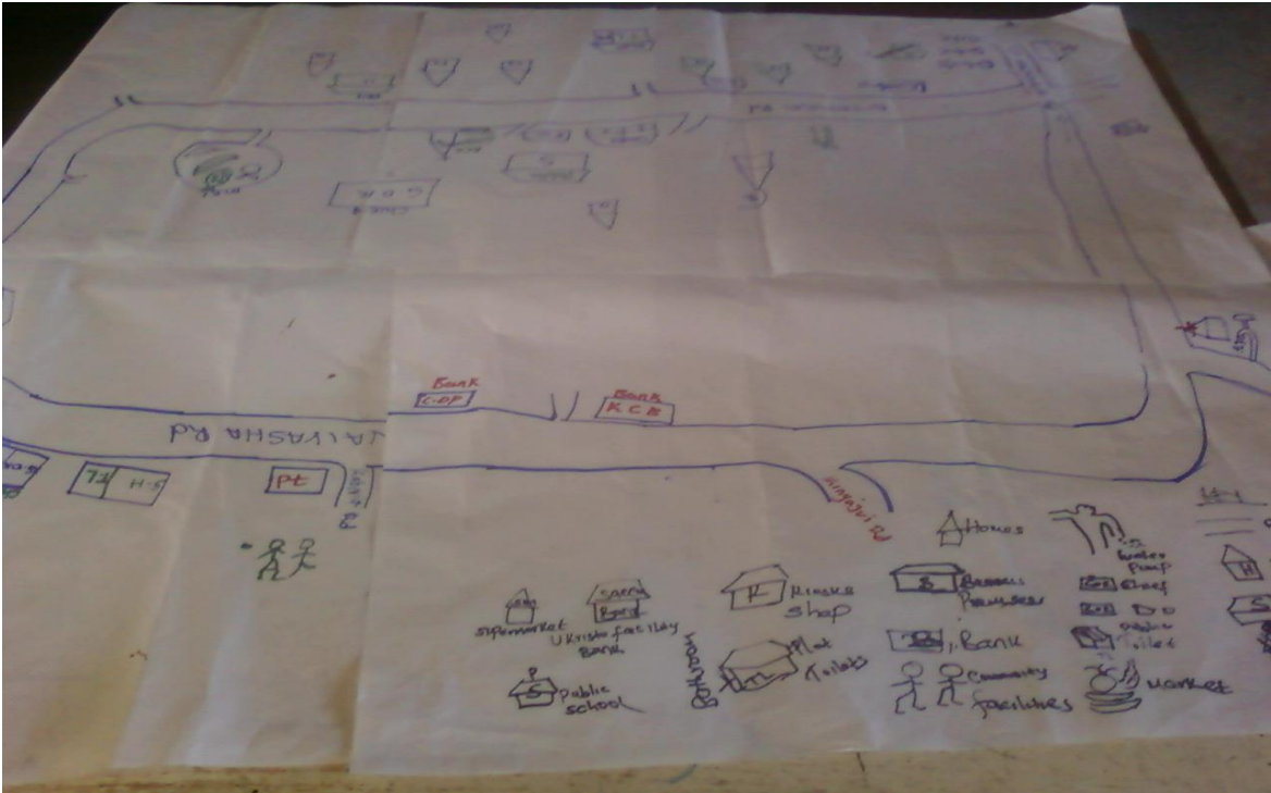
Figure 2: Kawangware community map by research participants